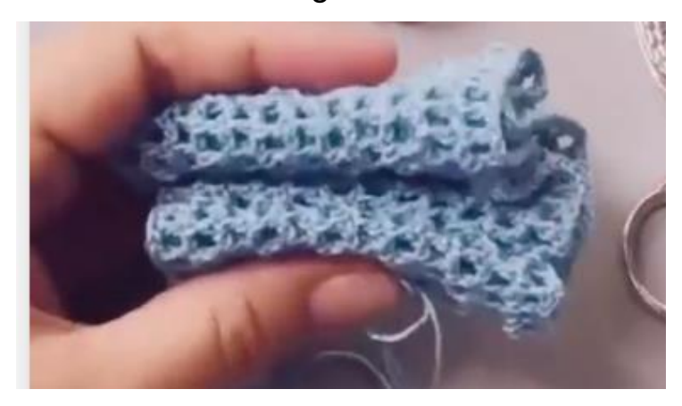
Then slip your black rubber band hair tie over the bundle and center it in the middle.

Once you have the ends stitched together, keep it turned wrong side out and scrunch it together into a bundle.